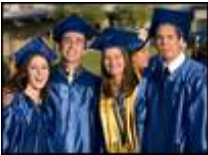
Linden High graduation