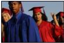
East Union High graduation